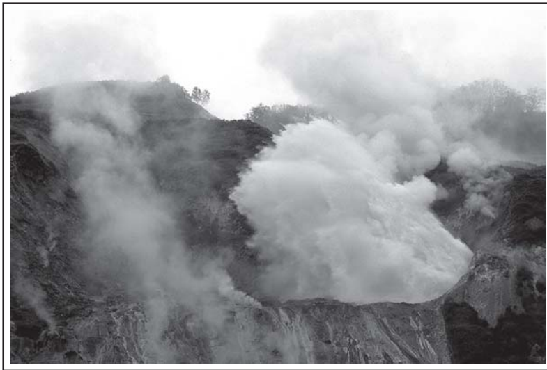
The water rise for a large Grot Geyser eruption, July 1991. An unnamed vent that erupts along with Grot can be seen above its opening.

still are used within GOSA for the major Valley geysers, since Giant and Grotto are major Yellowstone geysers and much confusion would result if such translations were used.