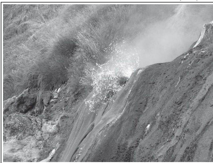
Unusual geyserite structure of this little geyser covers a slope like a cloth. Plashchanitsa means “(Christ’s) Shroud” – really folk name! 2011