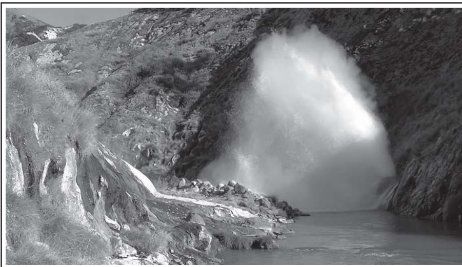
Large and beautiful, the Gorizontálny geyser has so inconspicuous structure and location that T. Ustinova did not discover it! 2011

The main difficulty when composing the list of geysers is that geyser action sometimes varies significantly over time. These changes can be connected with the variations in heat