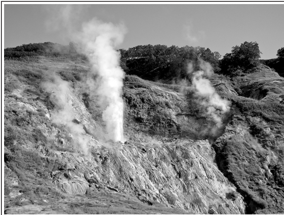
Fontan is the main actor on the Vitrazh, erupting each 25 min. Try to imagine, that in past it was twice higher! 2011

Volcanologists from the Institute of Volcanology started to work regularly in the Valley in the early 1970s, led by Viktor Sugrobov. They published their results in scientific articles virtually unknown to the public. In 1973, Sugrobov initiated stereo-photogrammetric surveys of the Valley, and the first large scale map (1:2000) was published in 1974, showing locations of 25 main geysers. This map was used