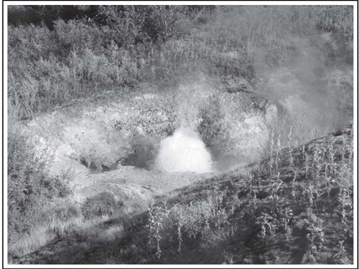
Vanna (bath) is actually a pool that splashes each 1-2 minutes. The shape of splashes varies, so you never know what is coming! 2011