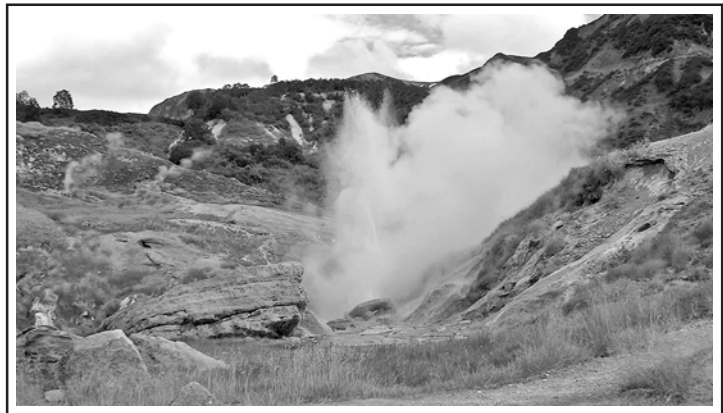
Long flowing of the Zhemchuzhnyy (pearl) is absolutely charming. With the best access among the large geysers, it is one of the loved ones. 2011